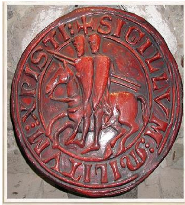
Knight Templar Seal

The most prominent, most utilized and best-known symbols of the Knights Templar are the Cross, Lamb of God, two Knights riding a single horse, and the Dome of the Rock. Each of the Grand Masters of the Knights Templar utilized at least one, if not all four, of these seals throughout their history. Although the actual Relics of the Knights Templar are lost in antiquity, they still hold a powerful stay over the imagination of each Sir Knight, both past and present.