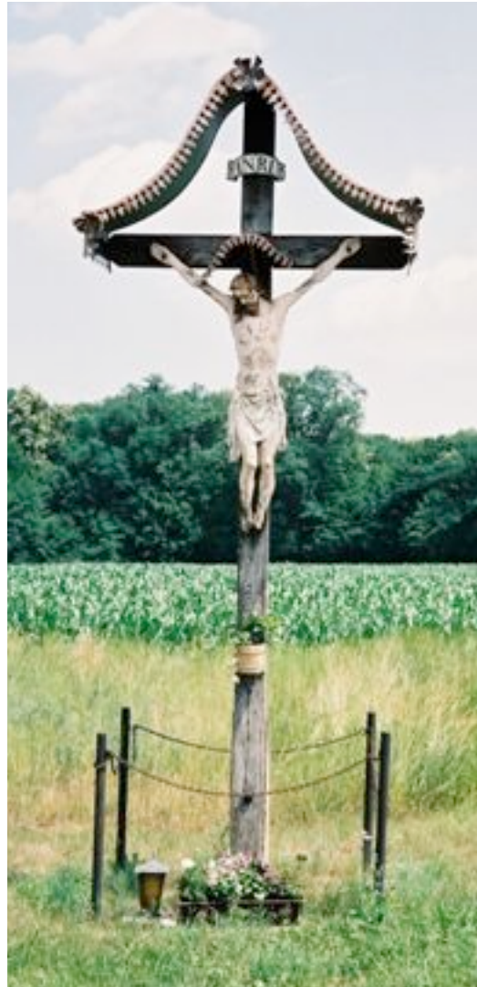
The letters INRI atop a crucifix near Mureck in rural Styria, Austria.

That is certainly true for the accounts of what Pontius Pilot orders for the sign above Jesus’ head on the cross. See Table 1 on the next page.