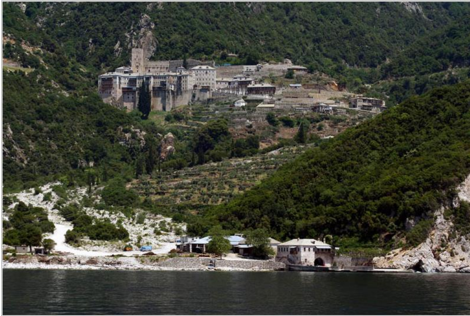
Saint Paul monastery and the sea port

The Monastery of Agios Pavlos (Saint Paul) is dedicated to Christ the Savior and is located on the west side of Mount Athos. Its existence first appears in documents of 972. Then it was mentioned in 1269. After the Catalan raids, it was degraded into a kellion, only to