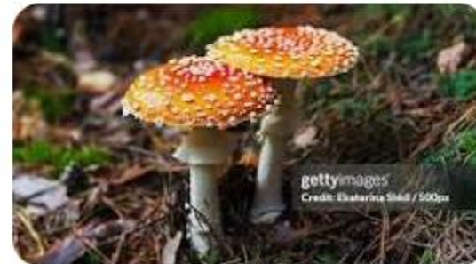
6,629 Fly Agaric Mushroom Stock Phot...