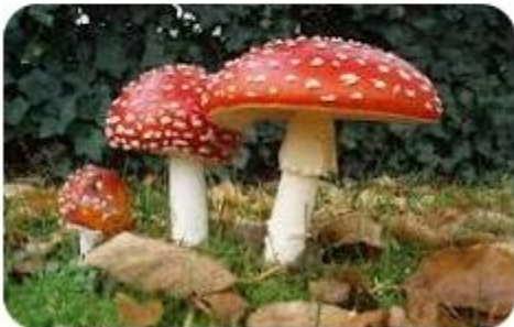
Amanita muscaria - Wikipedia