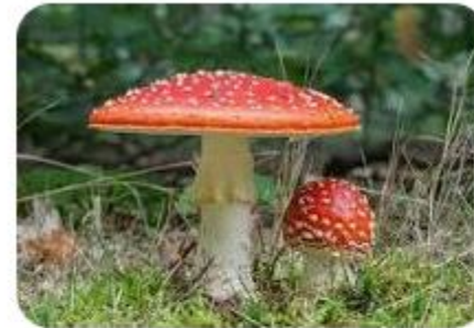
30,600+ Fly Agaric Mushroom ...