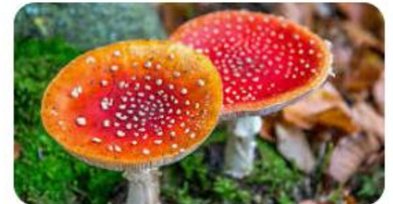
Fly agaric | Description, Mushroom, Hal...