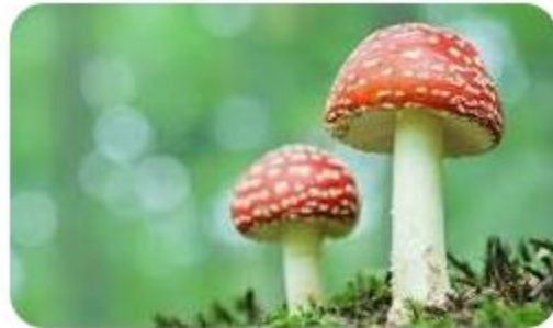
Fly Agaric ( Amanita muscaria ) - Wo...