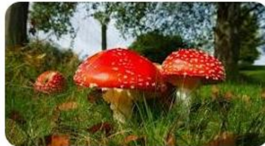
Fly Agaric ( Amanita muscaria ) - Woodl...