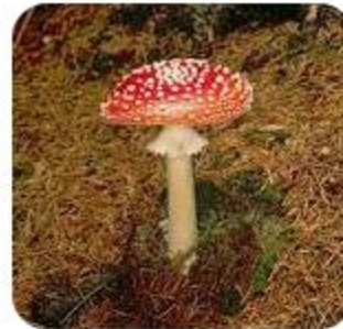
Fly agaric | Descriptio...